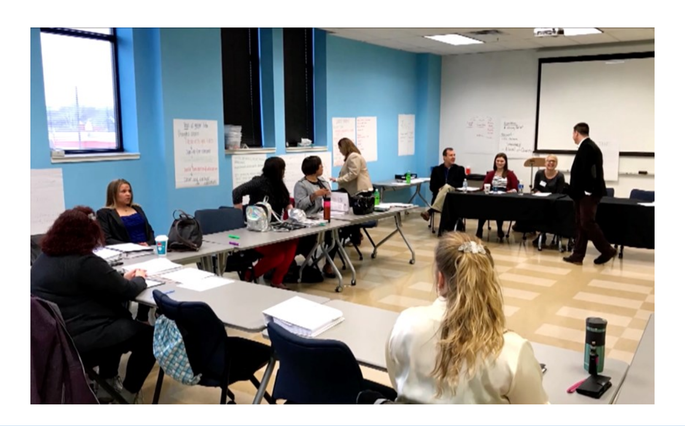
Volunteers teach an interactive class that equips candidates with various life skills.

The Foundations for a Better Life program is 12-weeks long and focuses on addressing five domains of life: physical, financial, spiritual, emotional, and relational. Barriers that defendants face in these domains often come from addiction, incarceration, and childhood poverty, which are all rising in the area. These factors directly hinder an individual's ability to generate an income for their family, leaving citizens "at-risk", hopeless, and unemployable.