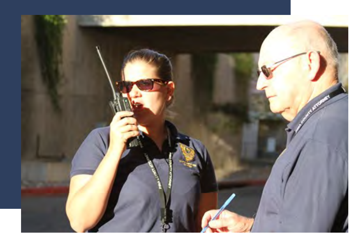
Volunteers communicate with law enforcement at a crime scene.

crime scenes throughout their scheduled shift using unmarked police cars. Volunteers carry handheld radios in addition to their cell phones to ensure that communication can occur with law enforcement at all times.