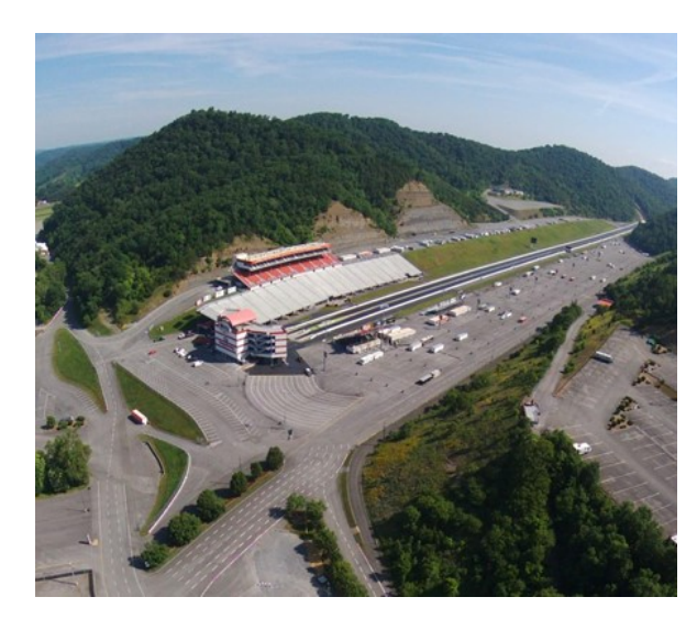
The FIRST Team recently held a drone mapping and scene reconstruction training at Bristol Motor Speedway.

Investigation Crime Lab Special Agents and a Toxicologist from the Williams L. Jenkins Forensic Center Section of Toxicology.