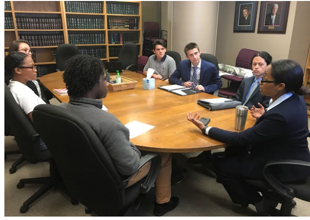
high school students about a case.

Though the criminal justice system is frequently showcased in the media and entertainment industries, it is not always depicted accurately. In order to provide youth in Knox County with an understanding of the criminal justice system based in fact rather than fiction, the 6th Judicial District runs the High School Job Shadow Program. The program formally began three years ago and offers rising juniors a front row seat to a prosecutor's true pursuit of justice.