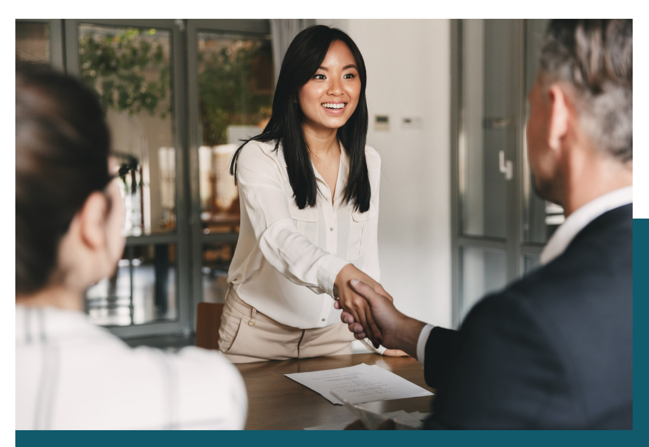
Thank you for participating!